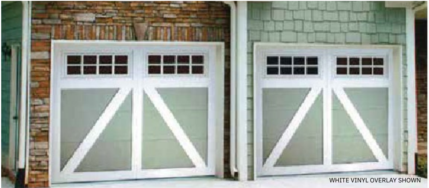
WHITE VINYL OVERLAY SHOWN

The Country Carriage House model is hand-crafted, with low maintenance in mind, of steel and vinyl.