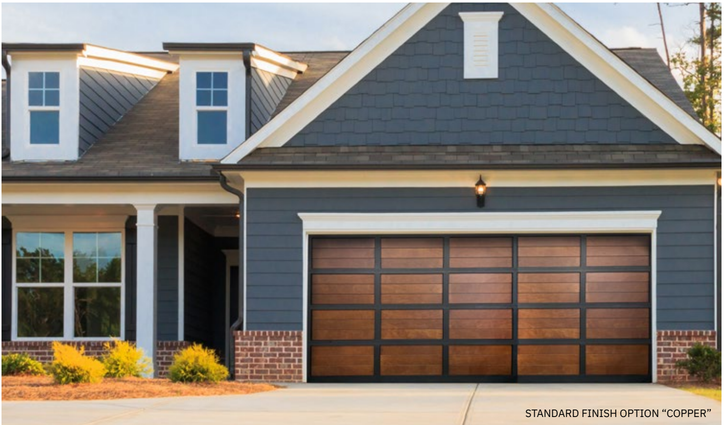
STANDARD FINISH OPTION "COPPER"

The TimbRLite model is perfect for a more sustainable wood garage door option.